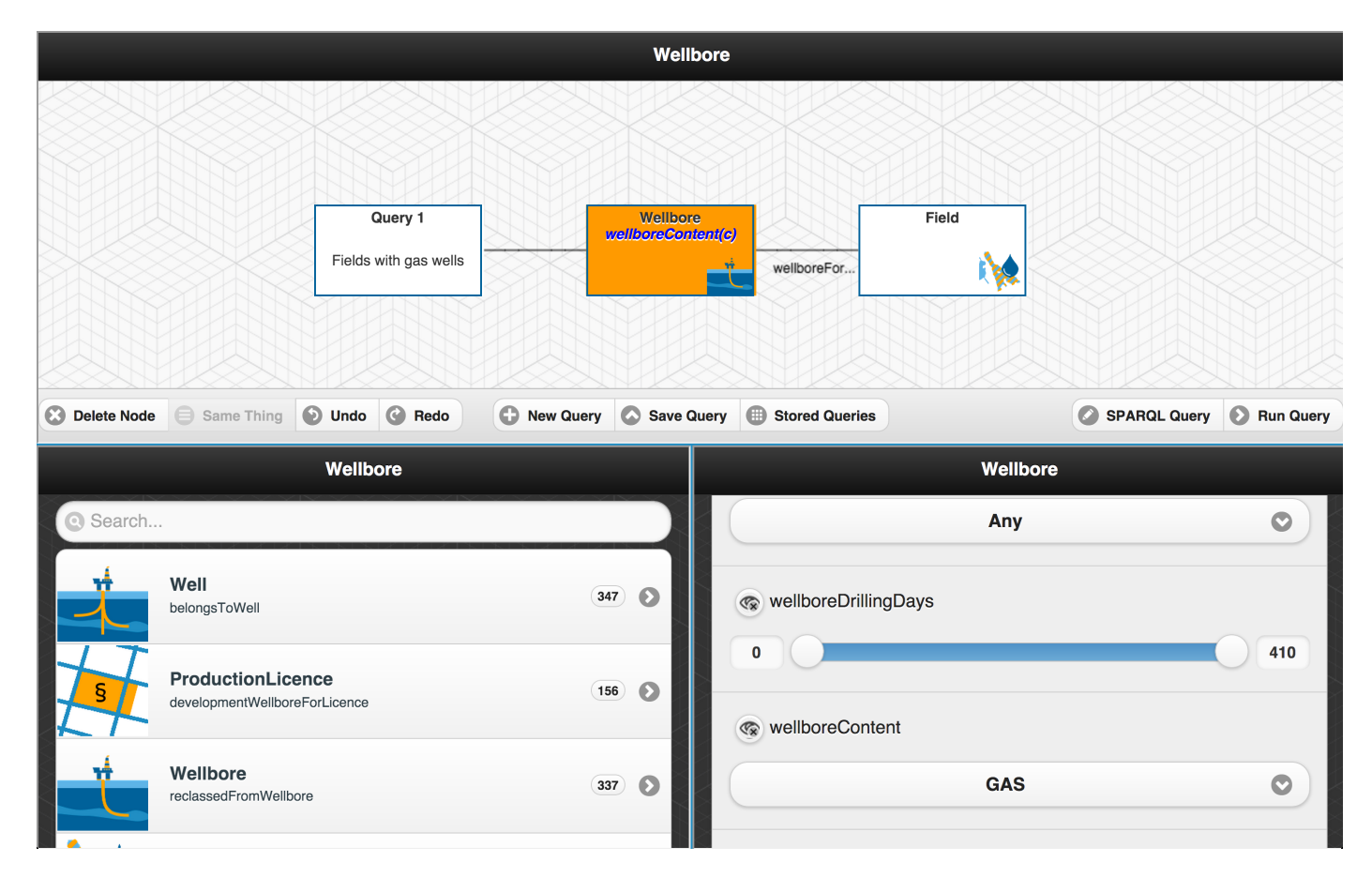
Fig. 2. Snapshot of the query interface of OptiqueVQS.

Visual approaches try to achieve good usability and sufficient expressiveness, although finding a good tradeoff is difficult. For example, visual SPARQL query builders are still too complicated for mainstream users, while typical facet-based systems limit queries to one class.