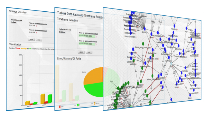
Figure 1: Monitoring dashboards

(ii) Sensors: This table is used to store static information about sensors. The attribute Id is the sensor's unique identifier, the attribute Component_Id is used to determine the compo-