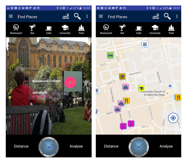
Figure 3: Final AR tourism app

Stage 5: Final Design . Before completion, we added one additional feature: offline content. This functionality was requested in our observations, as many tourists lack Internet access. Through following a UCD approach, we believe our final ToARist app (Figure 3) to be well informed.