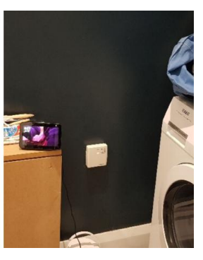
Figure 1: Smart products deployed in household four. Images from left to right: (a) Arlo Pro security camera at the front entry door, (b) Arlo Pro security camera in the bedroom, (c) Philips Hue light bulb in the bedroom, (d) Amazon Echo smart speaker in the bedroom, (e) Google Home smart speaker in the bedroom and (f) Amazon Echo Show smart display in the bathroom.