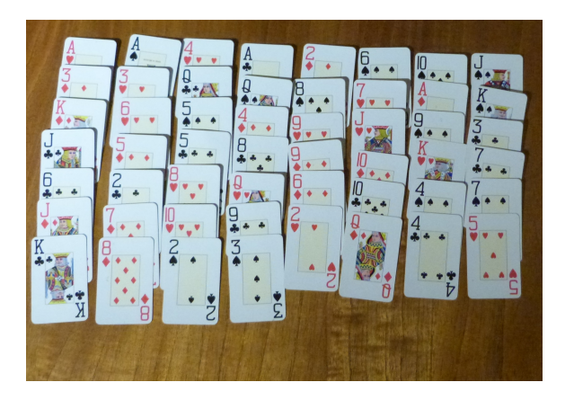
Fig. 2. Freecell (cells and foundation empty and not shown): not quite the impossible deal 11982 (see text)

Thanks to its popularity and the de facto standardisation of deal numbering, Freecell has been well studied with solver programs<sup>7</sup>, and a good deal is known about it including that only 8 of the first million deals are not solvable. The deal shown in Figure 2 was the result of the author trying to photograph the first of these, deal 11982. However there is a mistake: the deal 11982 has 10\heartsuit and 8\heartsuit swapped from their true positions in that deal. It is interesting that this small change actually makes the deal solvable (needing the full 4 cells), just as deal 11982 is soluble with 5. The distributed file freecelldeal.csp illustrates these facts.