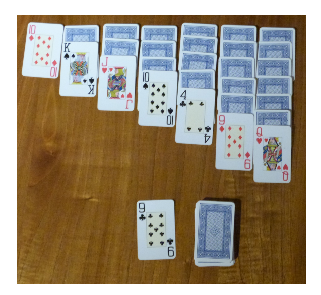
Fig. 4. Deal of Klondike, with stock and waste below, foundation missing and empty