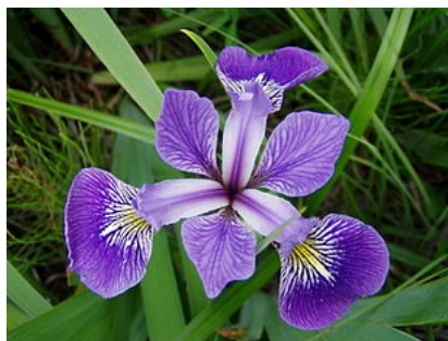
Figure 2: one of the types of iris